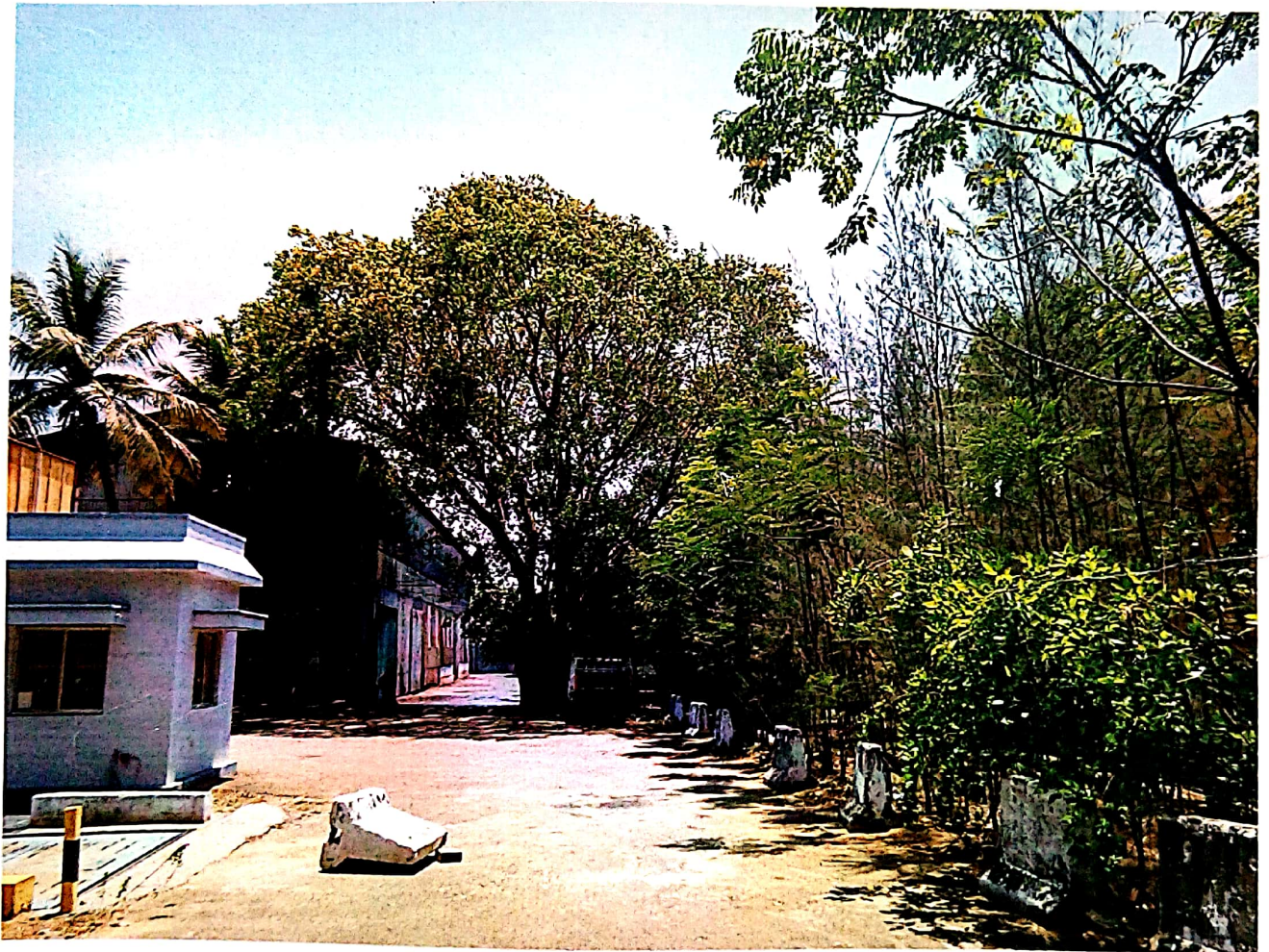
GREEN BELT - WESTERN SIDE FROM FACTORY.