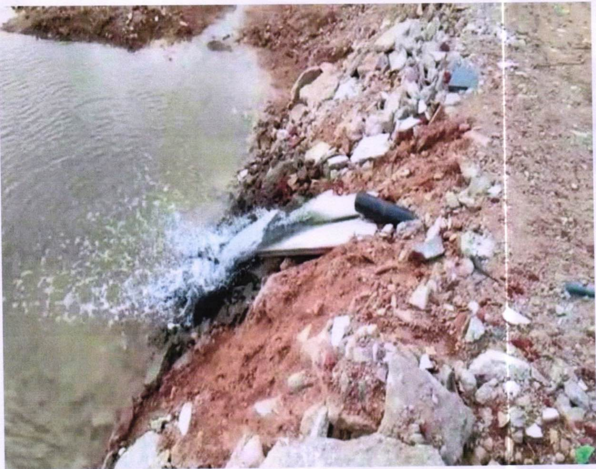
Fresh water (permeate/ condensate) disposed off