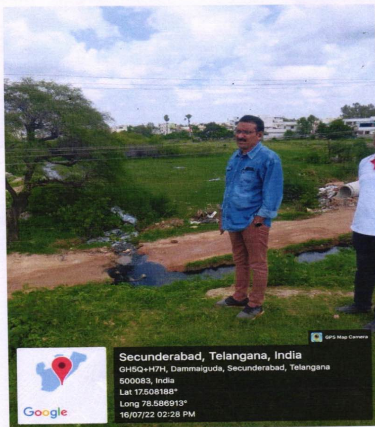
Photograph1 (taken at same location as in the Memo filed by applicants) showing the overflowing water from the Tank

assumed to be due to joining of sewerage from the habitation in the above catchment area into the tank as sewage like smell was noticed. However, laying of diversion pipeline for sewage is taken up by the Hyderabad Metropolitan Development Authority (HMDA) and the same is in progress. The Jawaharnagar plant is equipped with state of the art leachate treatment plant to treat and dispose the leachate generated during the processing and disposal of daily waste for which details were submitted in the reply. Further, all necessary measures are being taken by the Concessionaire to divert the Leachate into the plant and not to overflow from the site and the same is monitored by Environment Protection Training and Research Institute (EPTRI), who is the Independent Engineer. Hence, it is to submit that there is no possibility of leachate overflowing from site and mixing in the tank. However, the samples were sent for testing by EPTRI for further examination.