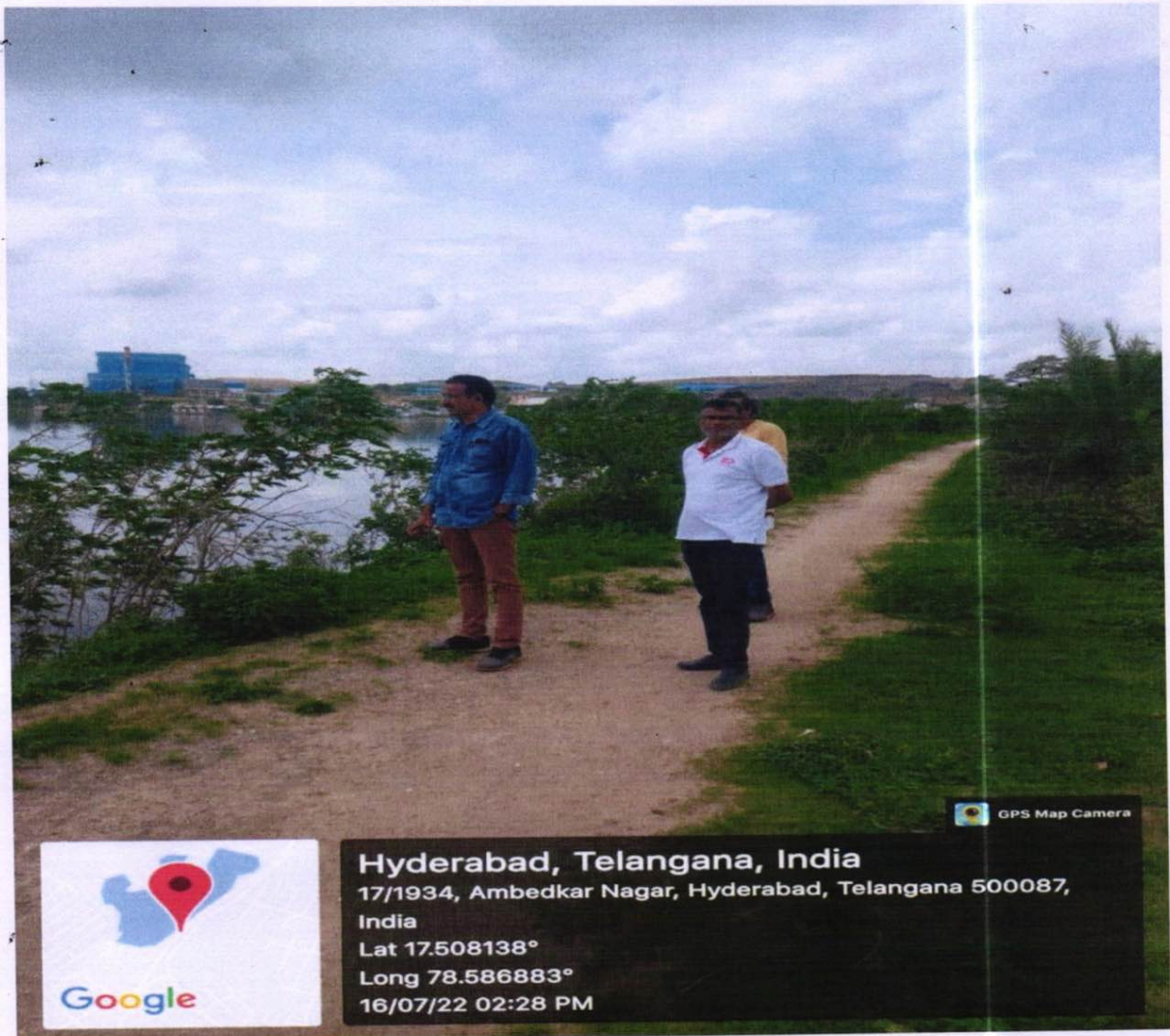
Black water noticed in the tank