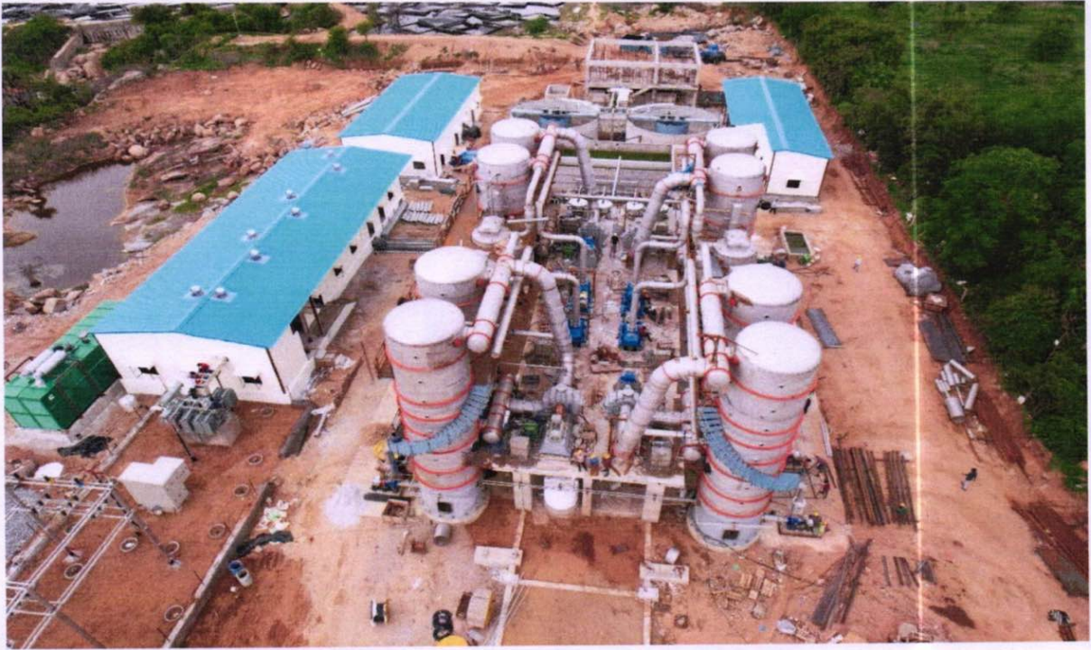
Legacy Leachate Treatment plant with MVRE Technology