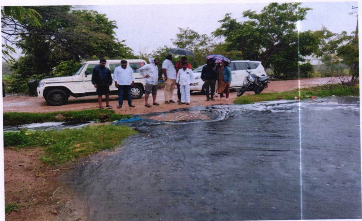
Flooding of Colonies as there is no surplus nala