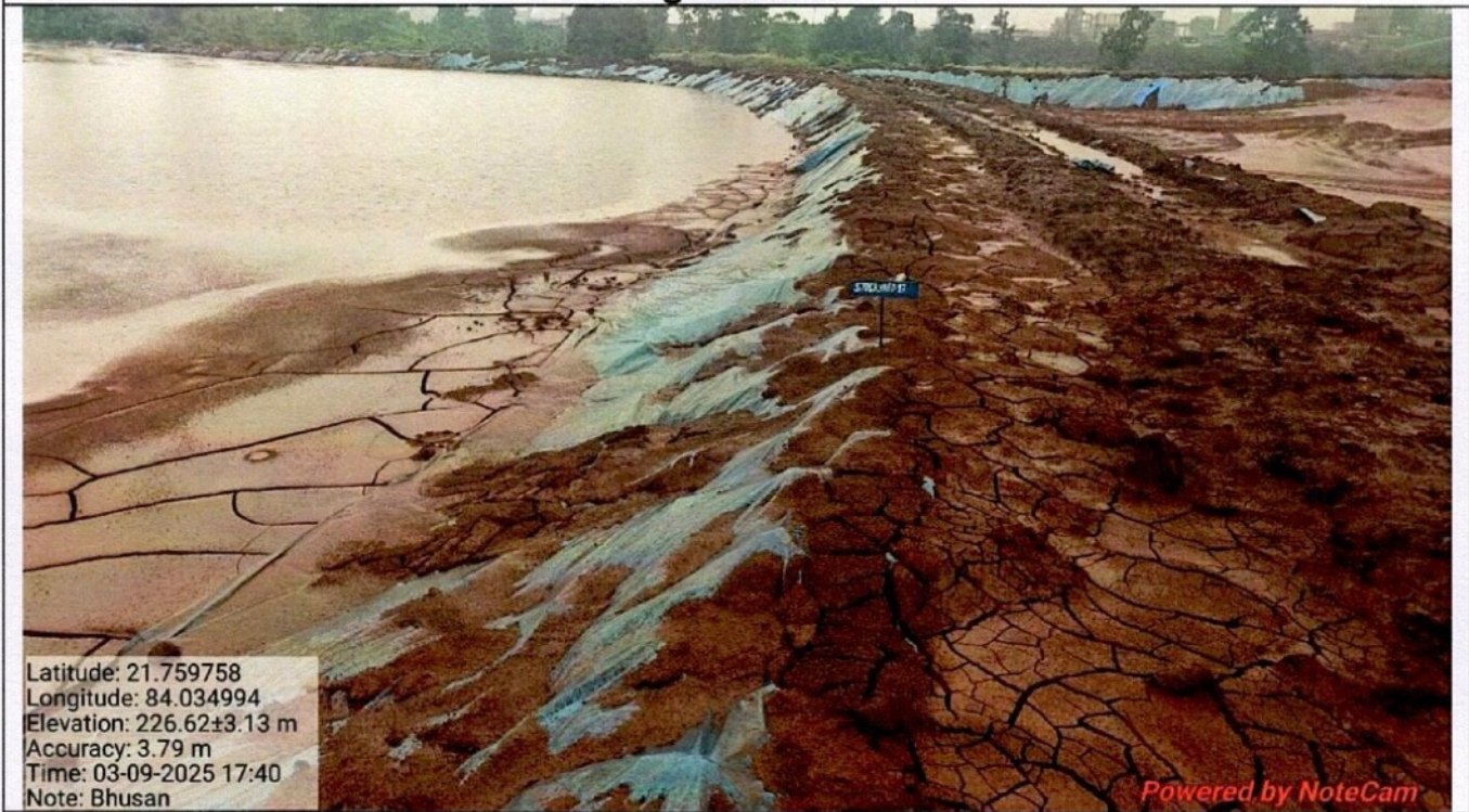
Tailing Pond No. 13