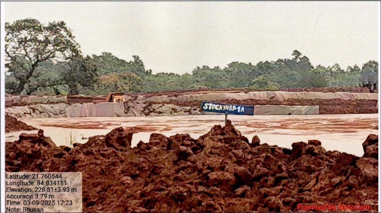
Tailing Pond No. 1A