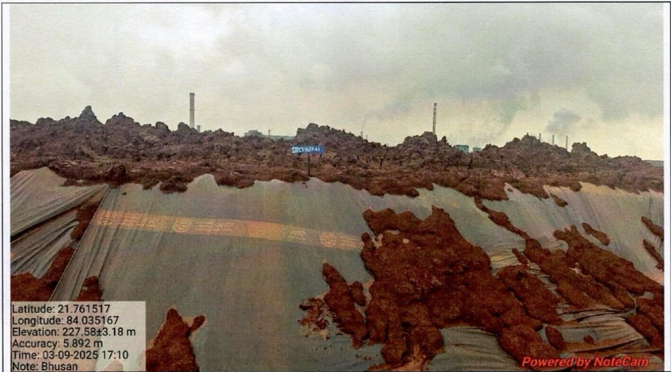
Tailing Pond No. 4A