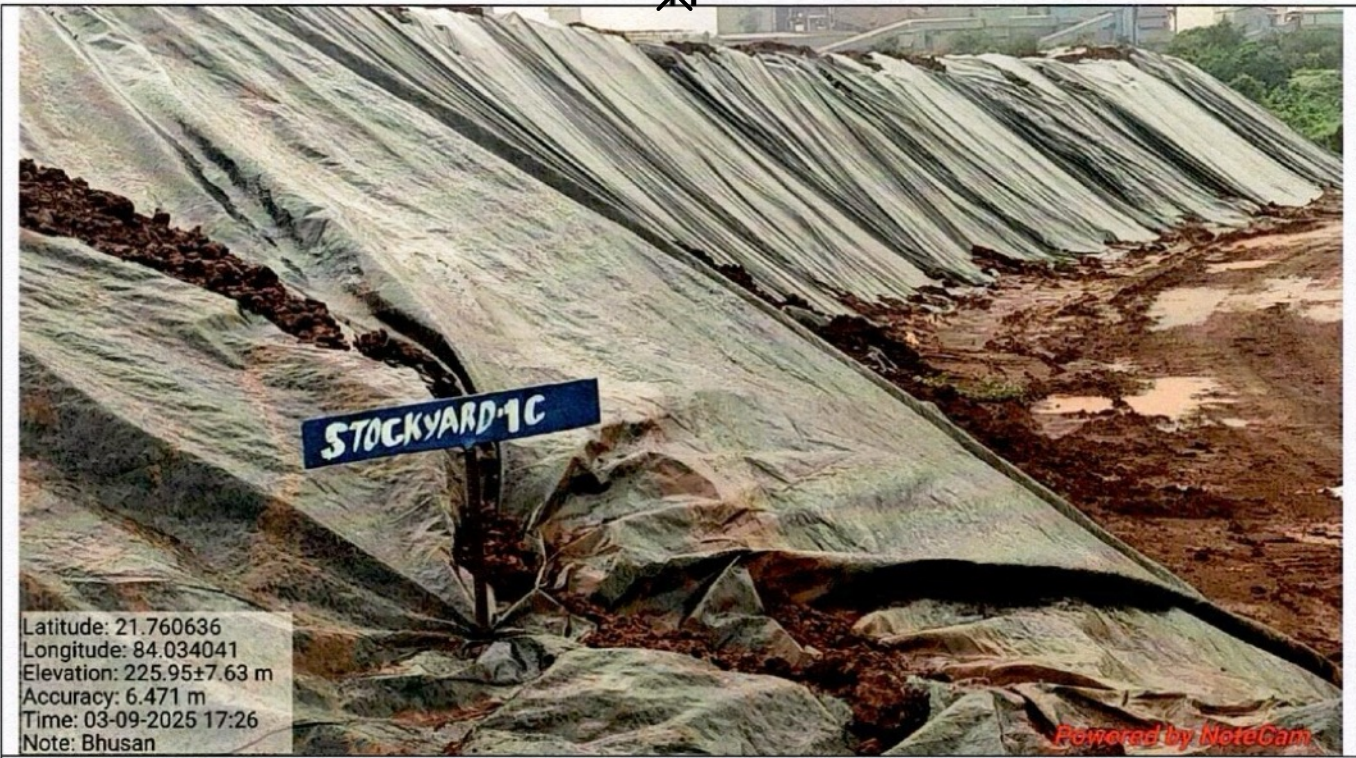
Tailing Pond No. 1C