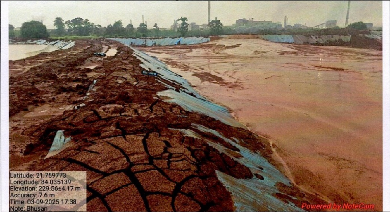
Tailing Pond No. 1B