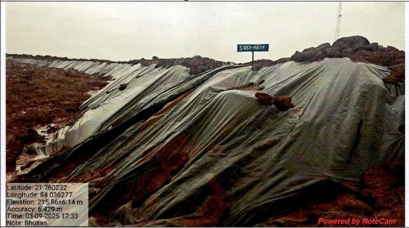
Tailing Pond No. 9