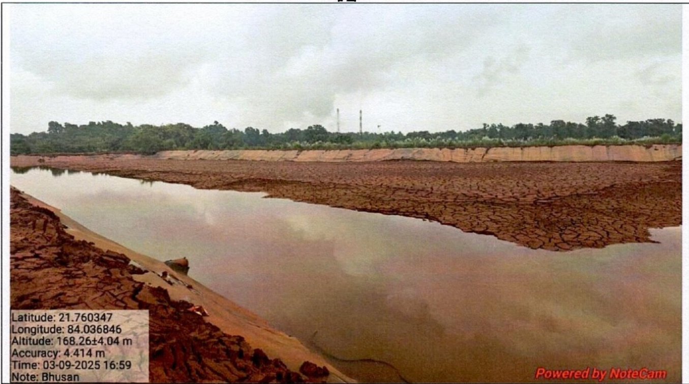
Tailing Pond No. 11