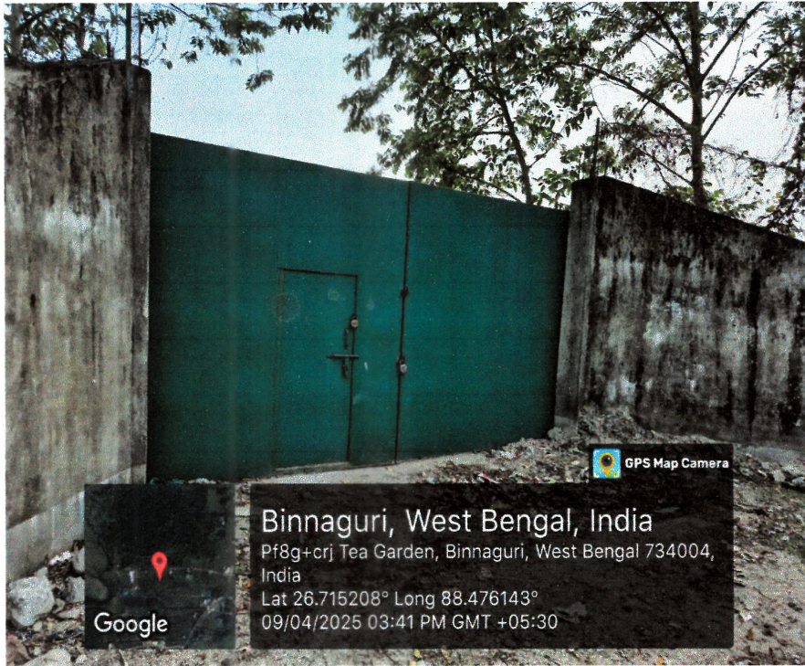
Gate found closed with lock and key