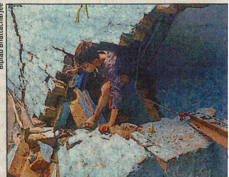
Cracks also developed on several dwellings around Belgachhia landfill after the land subsidence

Uttarpara Municipality in Hooghly to arrange extra water. The collection