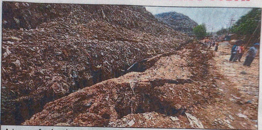
A team of scientists has recently visited the site