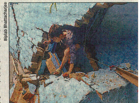
Cracks also developed on several dwellings around Belgachhia landfill after the land subsidence

On Friday morning, during a repair work, the damage happened to the pipeline. As a result, water supply to large parts of Howrah, including Liluah, Belgachhia, C Road, and B Road, was hit. Several areas under Shibpur Assembly constituency were also affected. A similar incident had occurred at the landfill