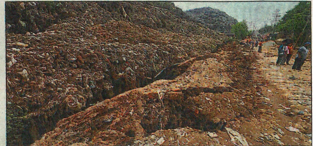
A team of scientists has recently visited the site