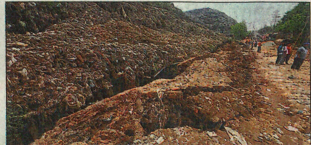
A team of scientists has recently visited the site