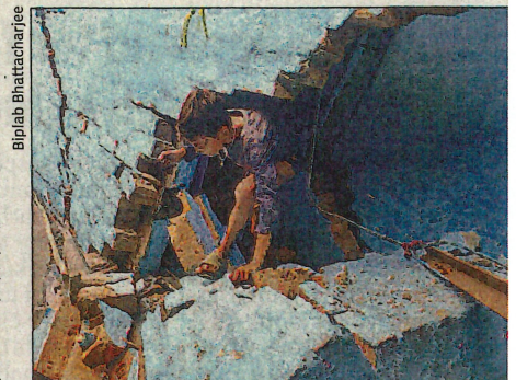
Cracks also developed on several dwellings around Belgachhia landfill after the land subsidence

On Friday morning, during a repair work, the damage happened to the pipeline. As a result, water supply to large parts of Howrah, including Liluah, Belgachhia, C Road, and B Road, was hit. Several areas under Shibpur Assembly constituency were also affected. A similar incident had occurred at the landfill