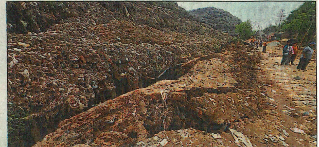
A team of scientists has recently visited the site