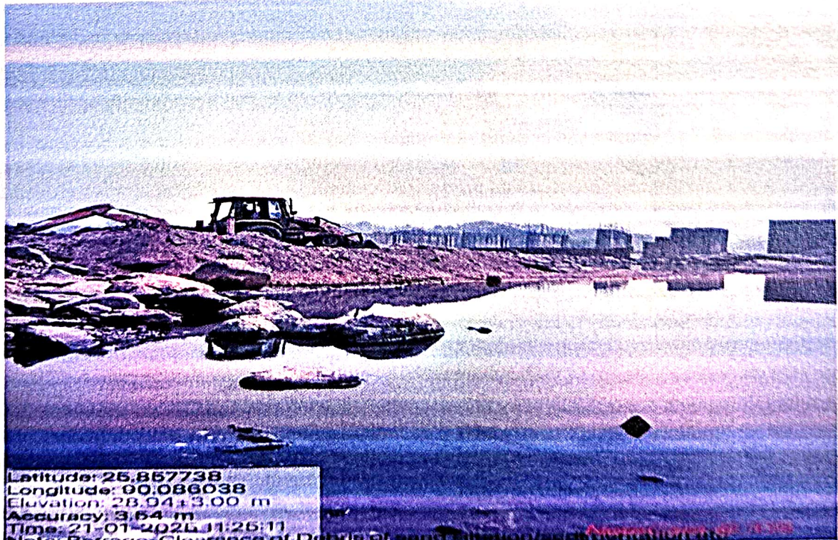
Latitude: 25.857738 Longitude: 90.086038 Elevation: 28.94±3.00 m Accuracy: 3.64 m Time: 21-01-2025 11:25:11 Note: Barrage-Clearance of Debris

1 Superintending Engineer PWD (Rde) Tura Circle, Tura