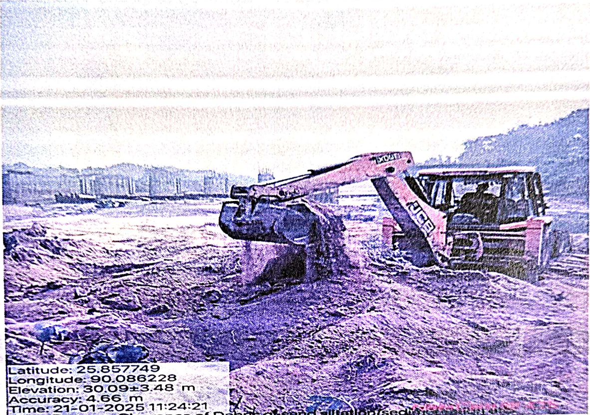
Latitude: 25.857749 Longitude: 90.086228 Elevation: 30.09±3.48 m Accuracy: 4.66 m Time: 21-01-2025 11:24:21 Note: Barrage-Clearance of Debris of sand siltation/sediment