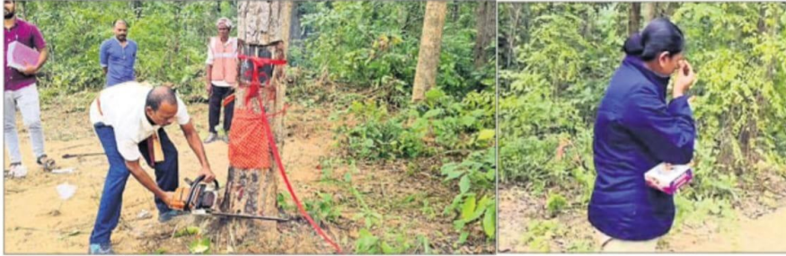
କୋଇଲା ଖନନ ପାଇଁ ଛେଡ଼ିପଦା ଜଙ୍ଗଲରୁ ଗଛ କଟା ଆରମ୍ଭ ହୋଇଛି ।