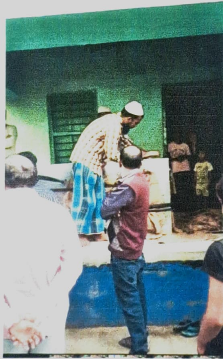
Photo 4: The complainant is using jute sack to reduce noise pollution