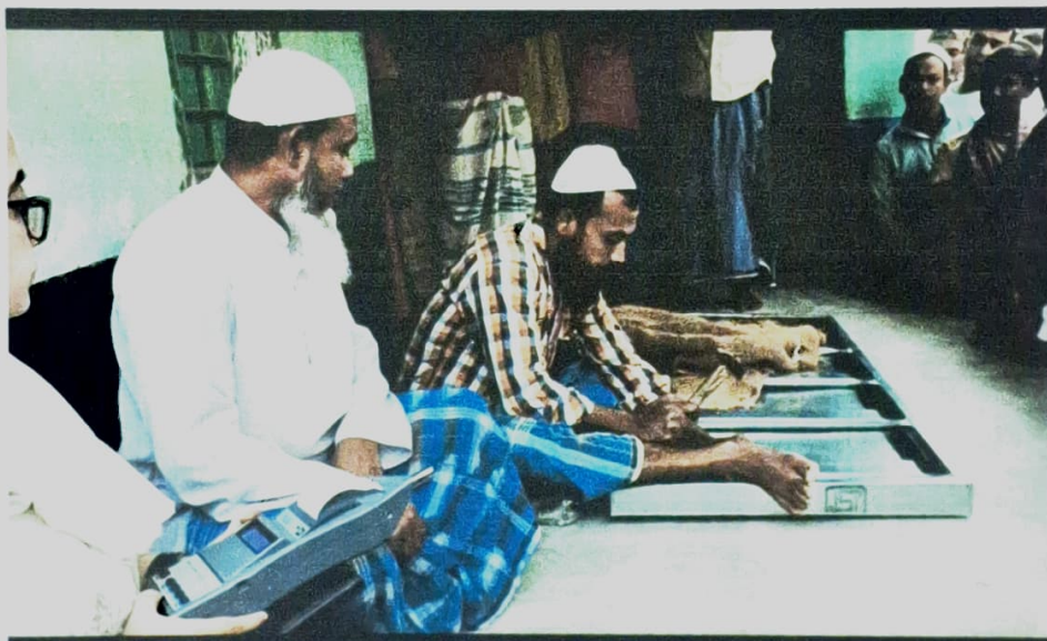
Photo 1: Noise level monitoring at the open verandah during manufacturing of Tin Box