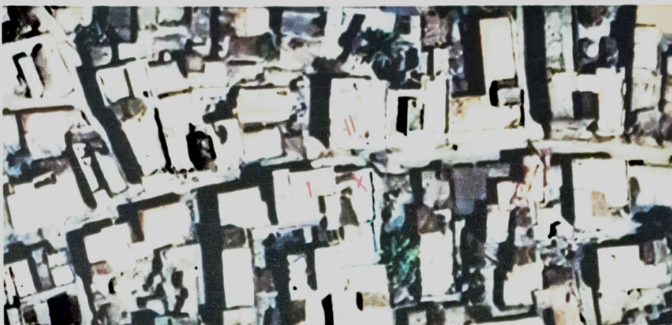
Figure 1: Varandah, where Tin Boxes are manufactured is shown with mark "X" and the complainant's house is shown with mark "I" and the house on opposite to open Verendah, where noise level was monitored is shown with mark "II":