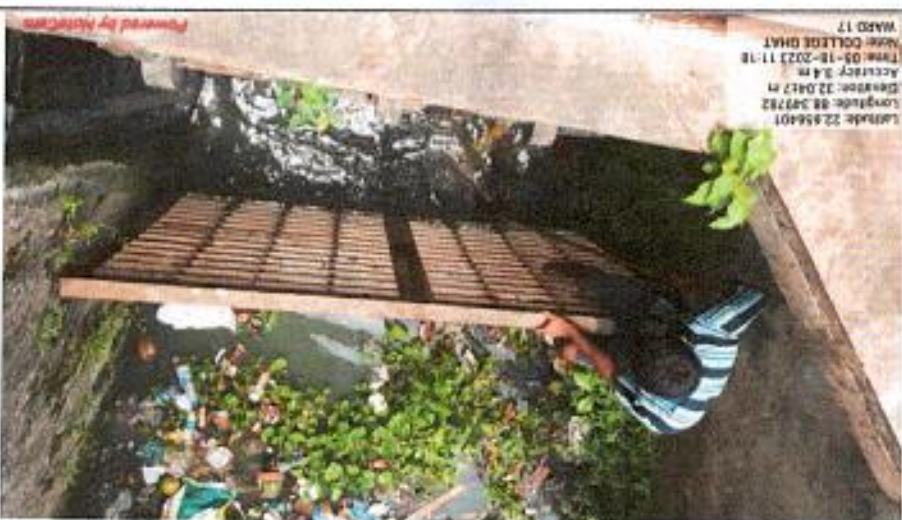
Photographs of present status of Outfalls/Drain under Uttarpura-Kotrung Municipality