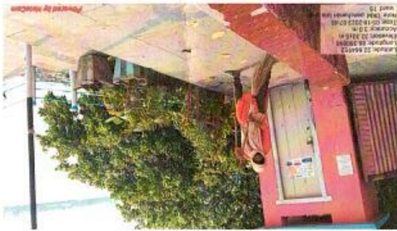
Photographs of Ganga Ghat cleaning under Uttarpara-Kotrung Municipality