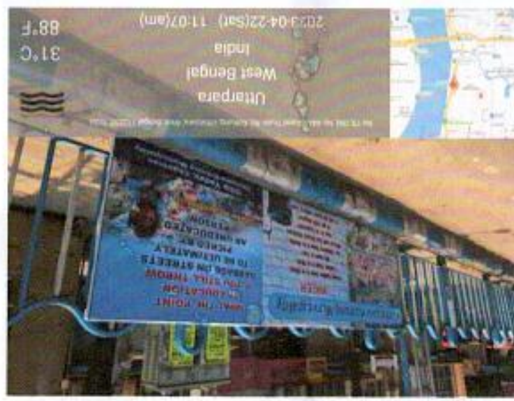
Photographs of IEC under Uttarpara-Kotrung Municipality