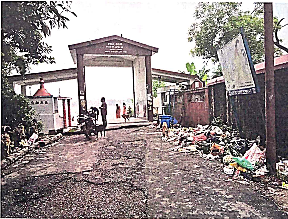
PAUL GHAT BALLY MUNICIPALITY Date- 4/10/23