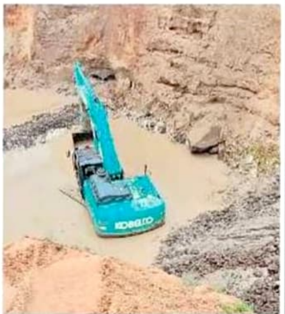
నీటిలోనే సల్మట్టిని చదును చేస్తున్న యంత్రం

జలాశయ నిర్మాణంలో సీవోటీ కీలకం. కట్ట ఎత్తు, నిల్వ సామర్థ్యాన్ని అనుసరించి.. దాని లోపలివైపు లోతు నుంచి మట్టి తవ్వాలి. కట్టను బలోపేతం చేస్తూ నిర్మించాలి. దాదాపు ప్రతి మీటరులోపే ఒక పొర మట్టి వేసి బారీ యంత్రాలతో(రోల్లర్) తొక్కించాలి. ప్రతి పొరకు సాంద్రత(డెన్సిటీ) 98 శాతం ఉండాలి.