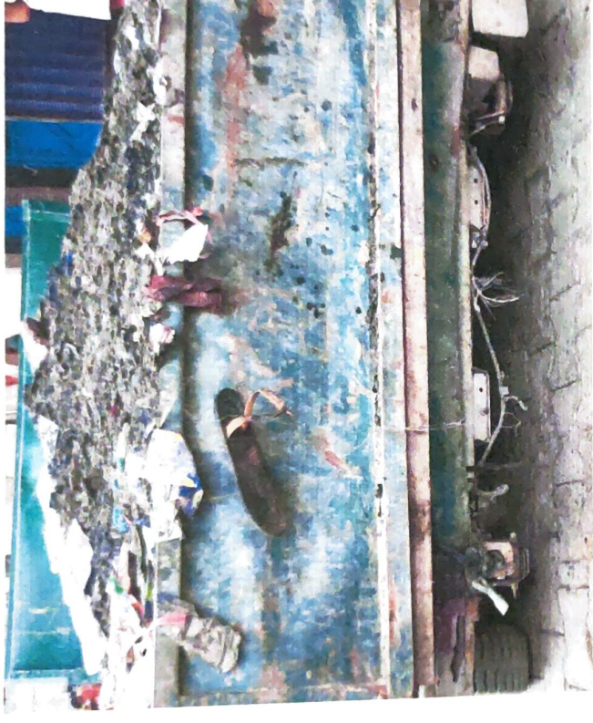
Figure 3:- Status of waste transportation in open as observed at the time of inspection

F3 3. Further, it was observed that the transportation of municipal solid waste was being done in open garbage dumpers which is also violation of Solid Waste Management Rules, 2016. Status of waste transportation as observed at the time of inspection has been presented in Figure 3 .