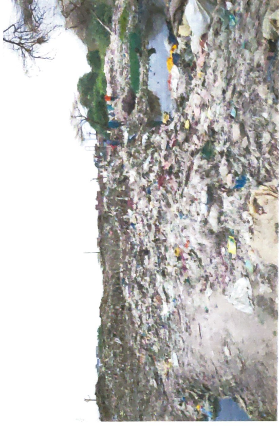
Figure 1 – Dumping site at Ahmad Nagar, Behind Lal Bagh, Loni, Chhazibad